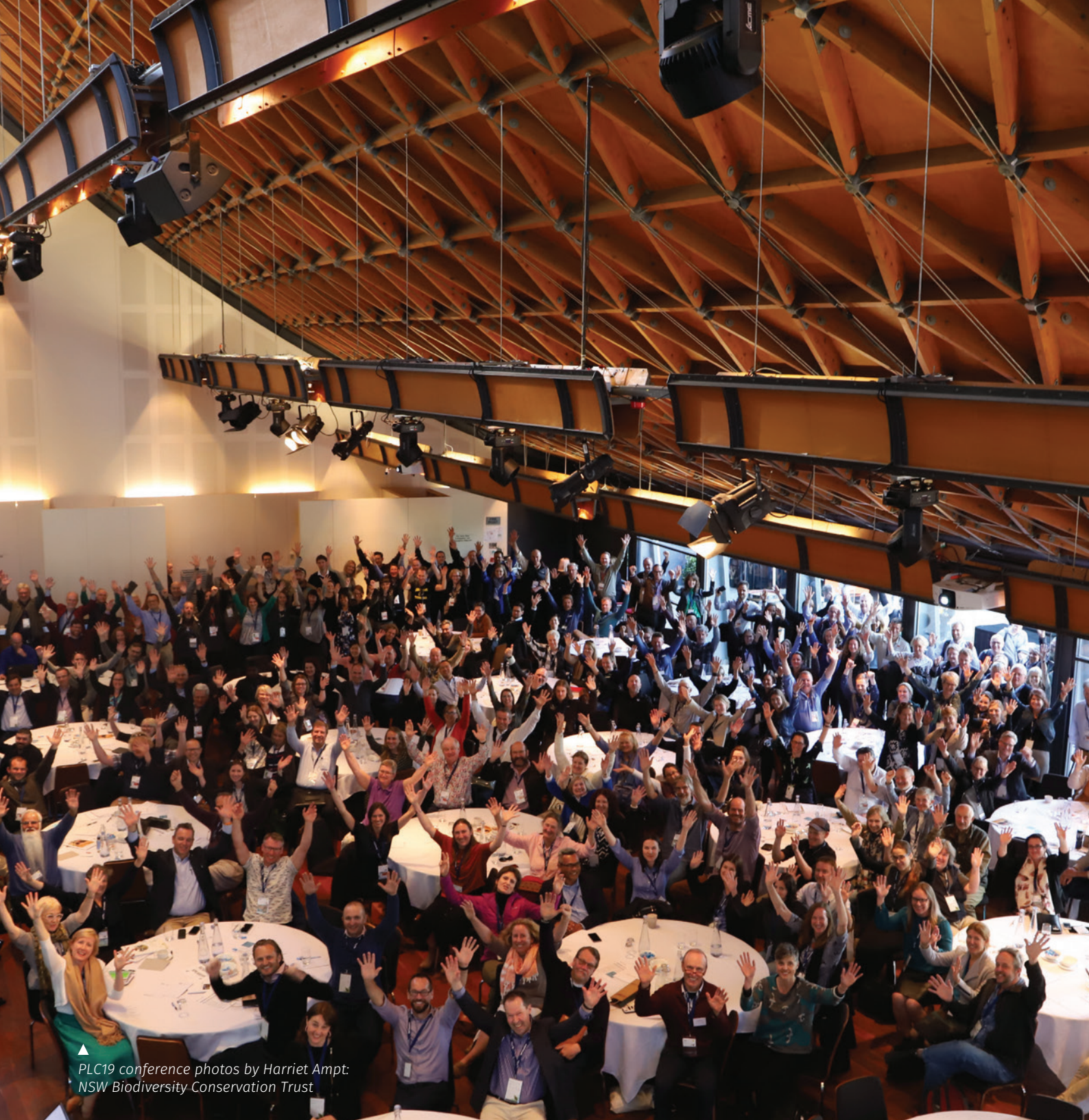
▲ PLC19 conference